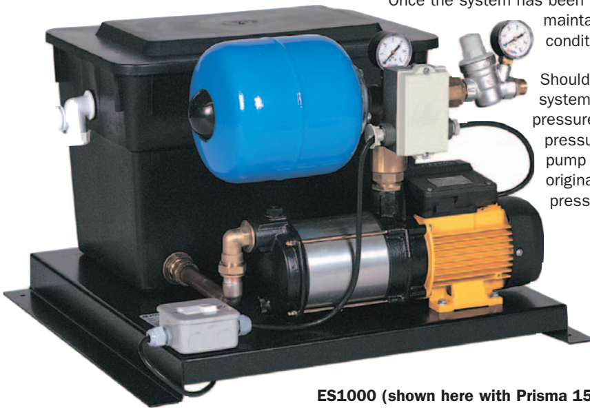
ES1000 (shown here with Prisma 15 pump, but standard version is with PAB 15/Per 50 pump).

Should a loss of water occur in the system, for any reason, the built-in pressure sensor will detect the drop in pressure and automatically start the pump restoring the system to the original cold fill pressure.