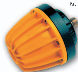
Kit Press 1/4"

To prevent water hammer in pressurised systems with minor leaks.