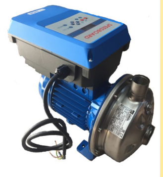
Ebara CDX + Speedboard

Sumak SMINOX /A100 pump with open impeller for Wort, transfer, bottling and recirculation, hot water