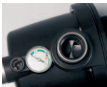
Pressure gauge with rotating glass.